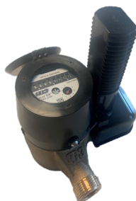
Optical Encoder Register w / Solo or Duo - AMR/AMI