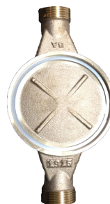
Perpetual® PD - Bottom Plastic, Bronze or Cast Iron