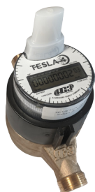
Tesla 4 TR Integrated Transceiver Register - AMR