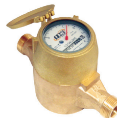
Direct Read Brass or Plastic