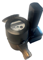
AMI / AMR