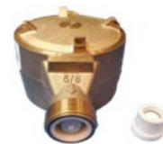
Optional Check Valve

Applications - For use in measurement of potable cold water in residential, commercial and industrial services where flow is in one direction only. Also available with Single Check NRV option for back flow prevention.